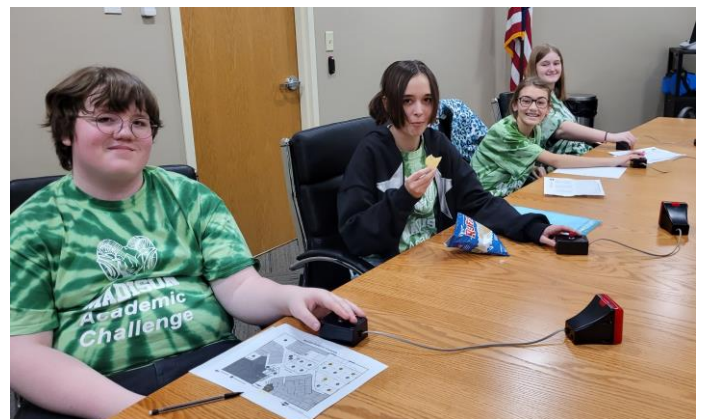
Our Academic Challenge teams had their first competition meet this month at the Mid-Ohio Educational Service Center! They competed against over 30 teams from around the area and will follow up with another competition meet next month. Go Rams!!