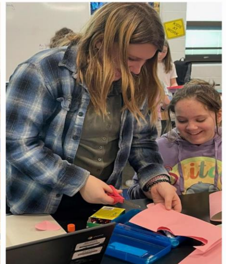
Students in 5 th grade are creating Valentine's Day cards for foster children in Richland County. This is part of a program organized by Richland County Children's Services in which foster children can receive an inspirational message of hope from others.